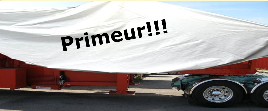
Morbark Wood Hog 3800 Forest